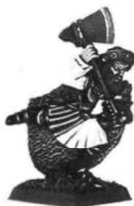
Ostlander Ruffian (below, left), Kin (below, centre) and Jaeger (below, right).

No Respect: Ruffians are objects of a strange mix of pity and abject fear for their fellows and may never become a Warband leader.